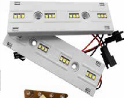
P.O.P. DISPLAY SCLM LED BOARDS

Hankscraft will help you design the perfect LED display to get the most out of your customers' retail space. Contact us today to get started!