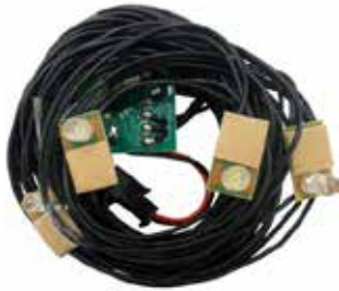
CUSTOM LED STRINGS PER REQUEST