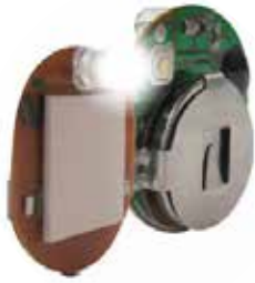
P.O.P. DISPLAY LED BUTTON FLASHERS