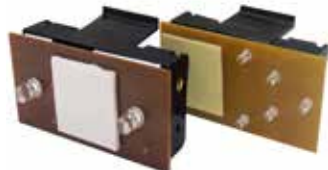
LED PRICE RAIL